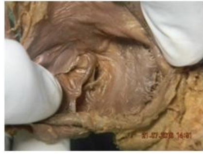
Fig 4 Coronary sinus opening without valve

Fig 3 Coronary sinus opening with membranous valve