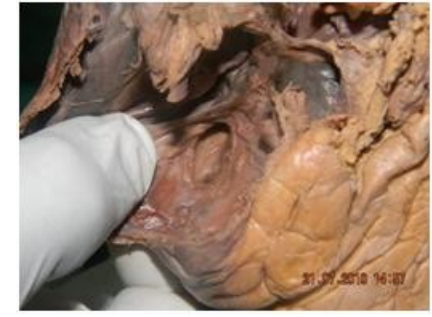
Fig 5 Location of great cardiac vein in the anterior interventricular groove

Fig 4 Coronary sinus opening without valve